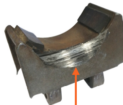
Second Wear Point