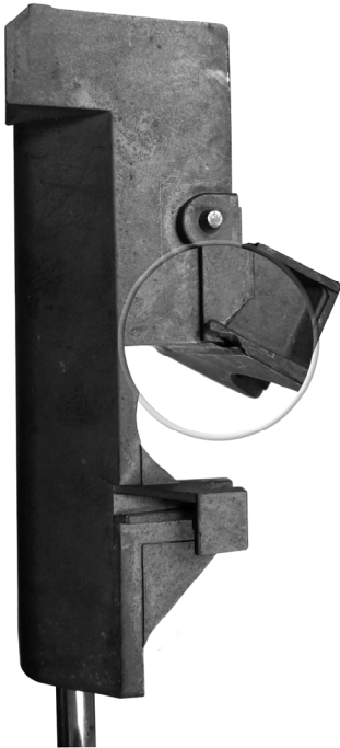
First Wear Point